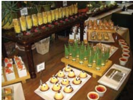
Photos from Top: Lobster entree at Lacroix Sunday Brunch desserts National Museum of American Jewish History Paintings at the Barnes Foundation.

Make sure to experience the Sunday Brunch at Lacroix , a celebration to eye and palate. The lavish spreads feature artisti-